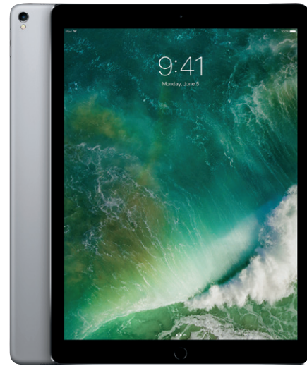
Apple® iPad® Pro