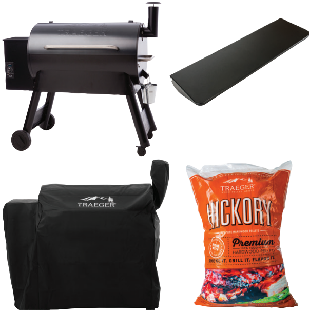
Traeger™ Pellet Grill Set