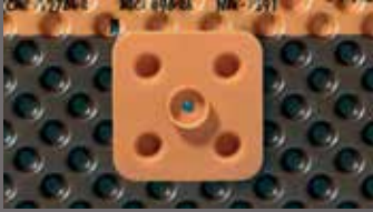
DELTA®-FAST'ner multistud fastener for secure attachment of DELTA®-MS.

Dörken makes your life easier – systematically.