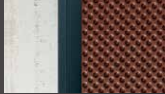
DELTA®-MOLDSTRIP molding used around window cut-outs and at grade level/changes.