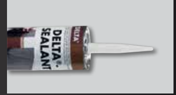
DELTA®-SEALANT elastic sealing compound used at overlaps and penetrations.

DELTA® is a registered trademark of Ewald Dörken AG, Herdecke, Germany.