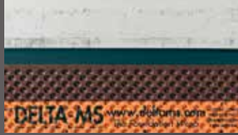
DELTA®-FLASH angled flashing used at top of flat tab.