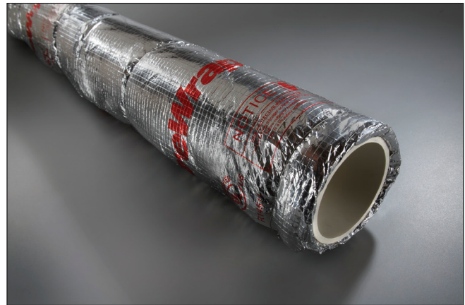
FyreWrap 0.5 Plenum Insulation