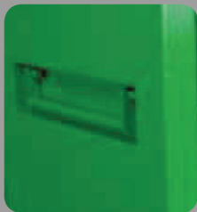
RECESSED HANDLES for positive gripping even with a gloved hand