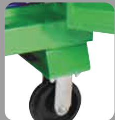
CASTER-READY 4-WAY SKIDS constructed of heavy duty 7-gauge steel